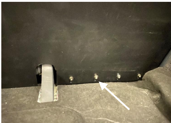
Place barrier into vehicle, attach bottom with (8) 1/4" serrated nuts.