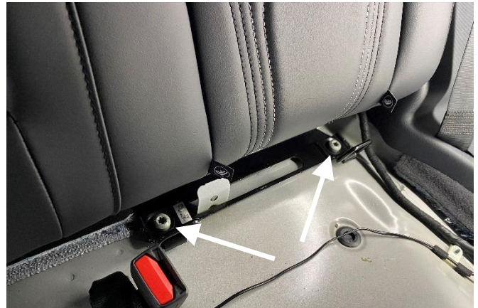
Remove T-50 Torx bolts from driver and passenger side lower seat back brackets.