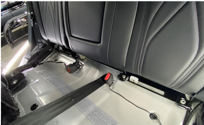
Carefully Remove Rear seat bottom by pulling up and then towards the front of the vehicle.