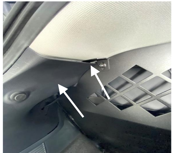
Prior to placing barrier into the vehicle, remove C-pillar trim and install upper barrier brackets into OEM slot with 5/16 carriage bolt and serrated nut.