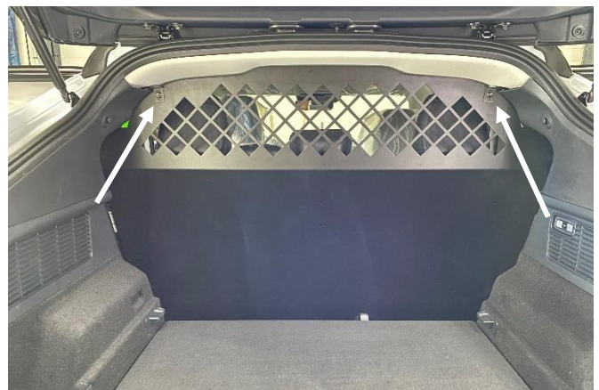
Attach top corners with 5/16" x 3/4" carriage bolts and serrated nuts. Tighten all hardware.