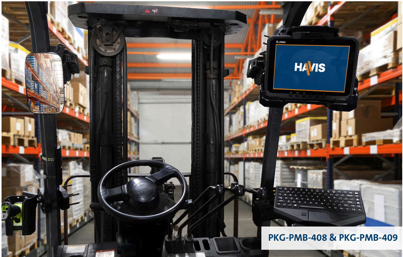
PKG-PMB-408 & PKG-PMB-409