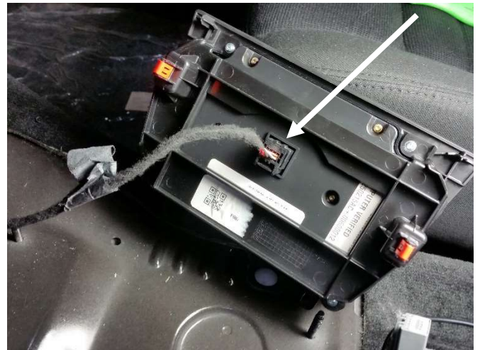
Pull HVAC controller towards rear of vehicle and unplug.