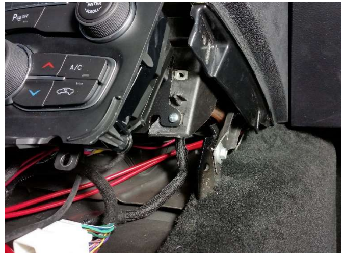
Confirm everything is lined up and tighten hardware.