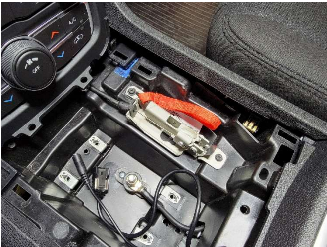
Remove Manual Park Release (MPR) hardware.