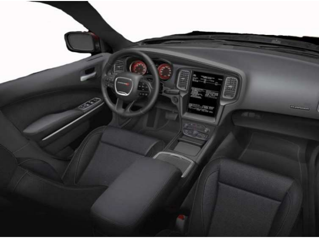
View of Street Appearance Package Charger full length console and Large touch screen display. ( OEM order codes AV2 )