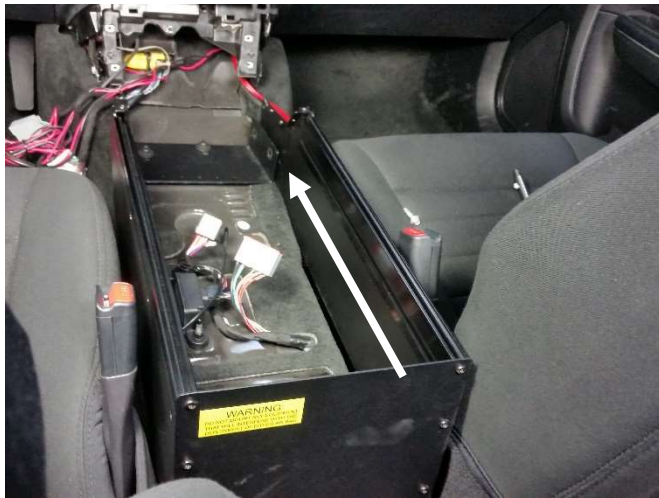
Slide C-VS-1800-CHGR-3 console housing into the vehicle towards the dash.