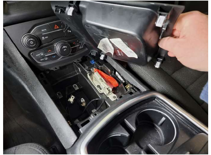
Remove cover in front of armrest.