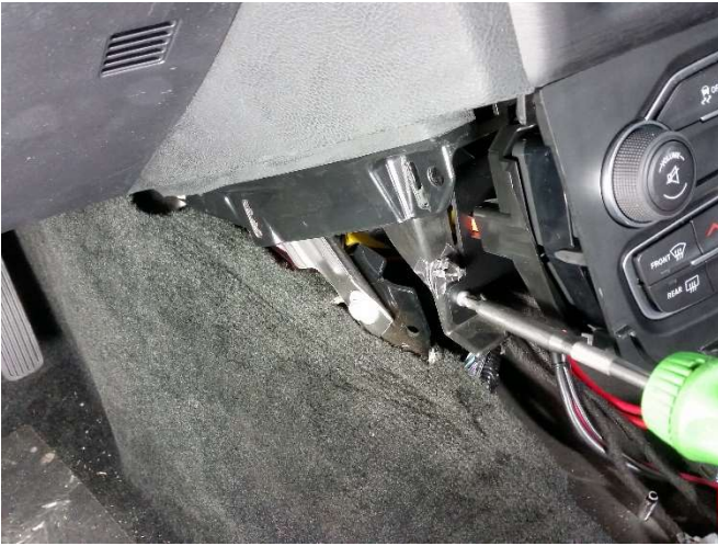
Install the bracket and controller into the dash using #10 x 3/4" sheet metal screws.