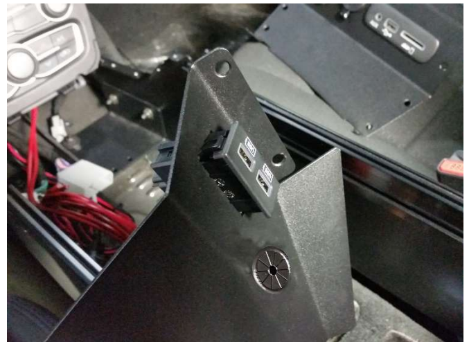
Install the previously removed dual USB assembly into the passenger side trim panel. Install the trim panel using the #8-18 x 1/4" flat head screws.