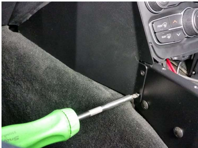
Install driver side trim panel using #8-18 x 1/4" Phillips flat head screws.