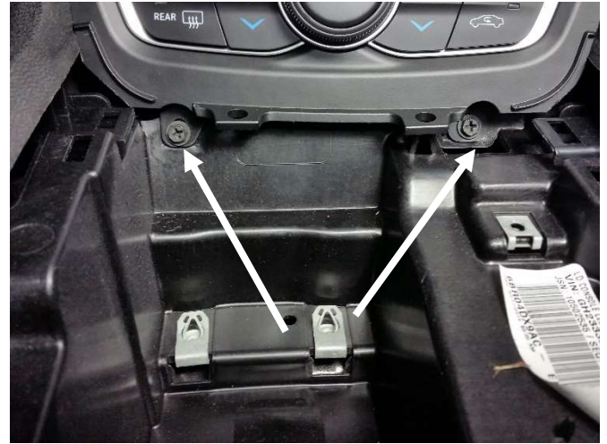
Locate two (2) screws under HVAC control.