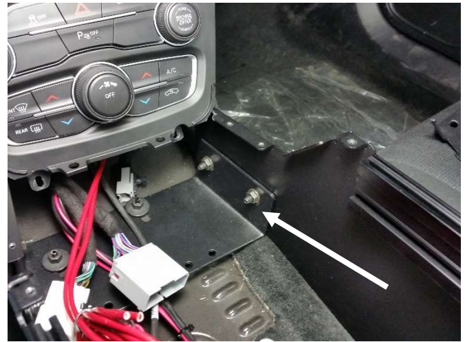
Line up to front mounting plate and loosely install with 1/4" x 3/4" carriage bolts and serrated nuts.