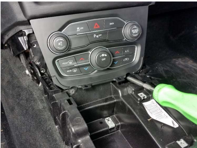
Remove screws and set aside for future use.