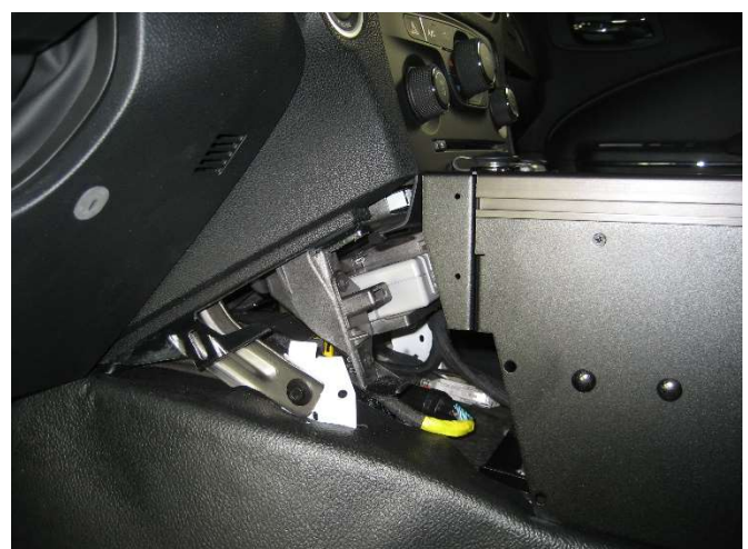
Place console housing into vehicle. Slide console up to the dash and loosely start previously removed nuts.