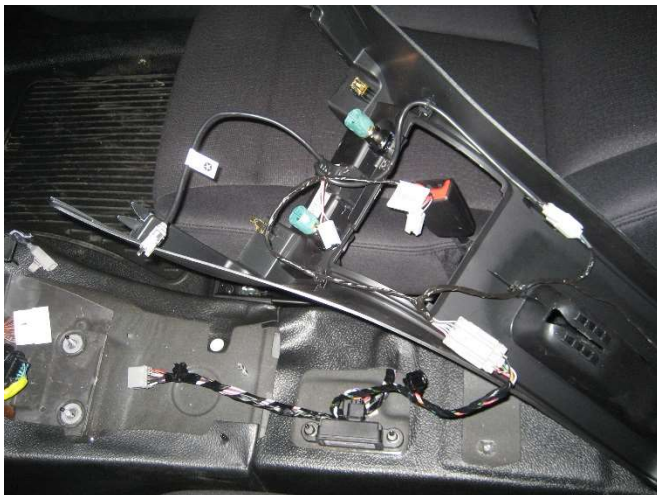
Remove O.E.M. plastic center console