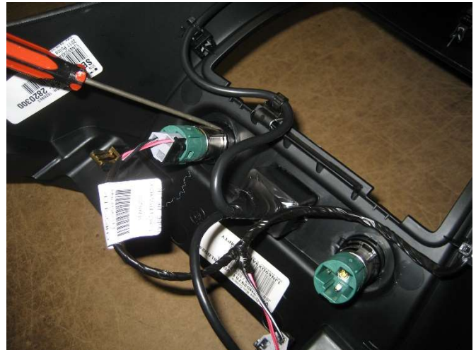
Remove OEM lighter plugs and AUX panel from factory center console.