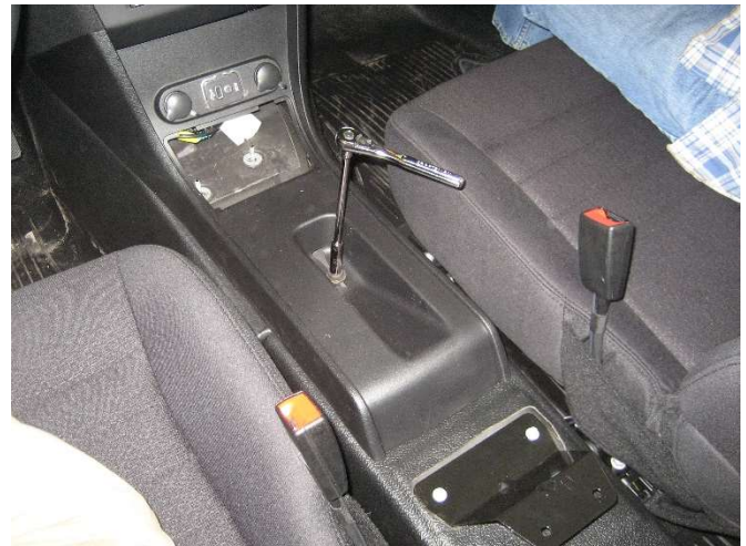
Remove bolts that hold underside of extrusion to rear floor bracket. (7/16 wrench) Remove rear floor bracket bolts and center console bolt. (10mm)