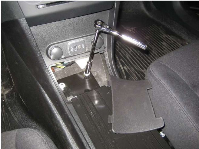
Remove forward O.E.M console plastic cover and remove two (2) nuts from front floor bracket. Nuts to be reused later. (10mm)