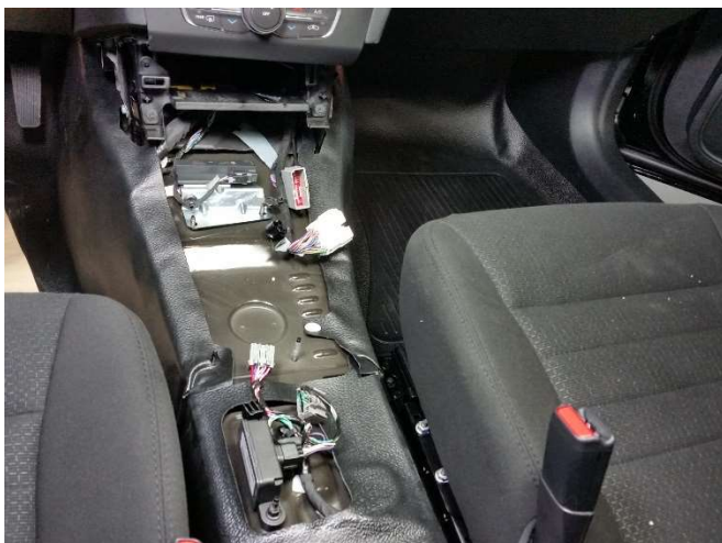
Plug O.E.M. wire harness back onto original connectors.