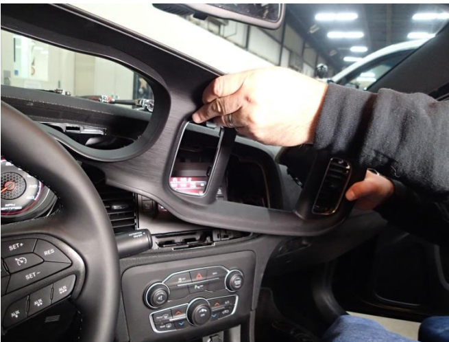
Dash panel partially removed.