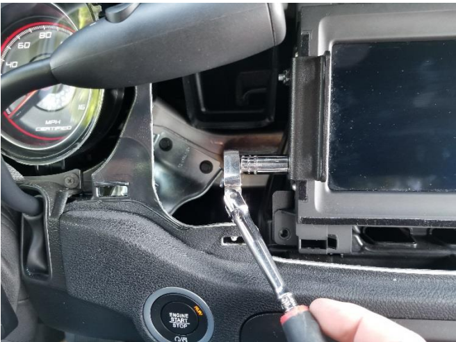
Repeat process for driver side and tighten hardware.