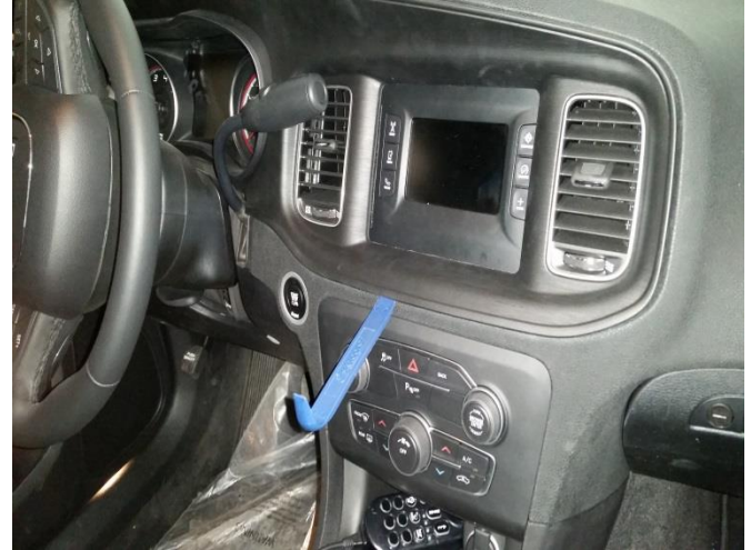
Gently pry along the dash with a flat blade panel removal tool. Slowly working along the frame.