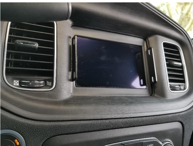
Make sure the side mounting brackets are even along the dash and the dash is fully seated back into place.