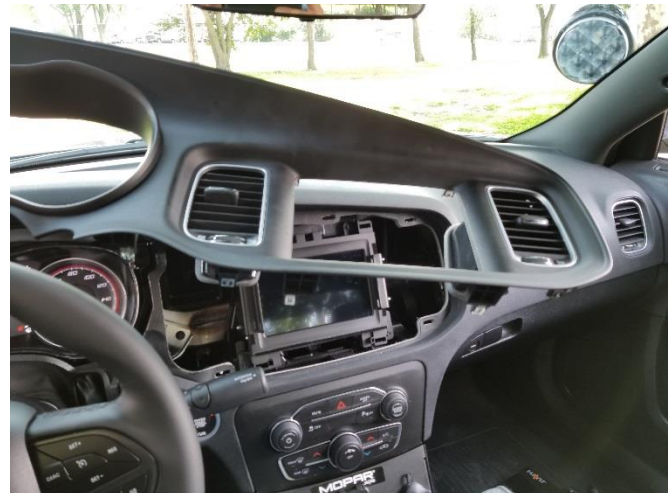
Carefully reinstall previously removed dash panel.