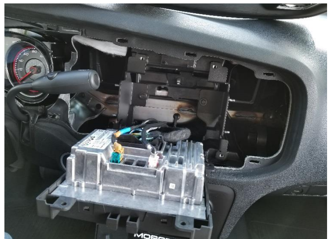
Repeat process for both sides. Make sure brackets fit around radio snug.