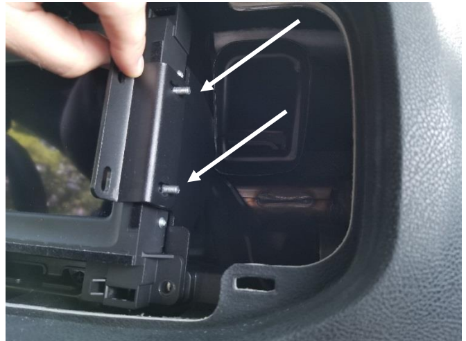
Attach side mounting brackets to the side support brackets using 10-32 nylock nuts and flat washers.