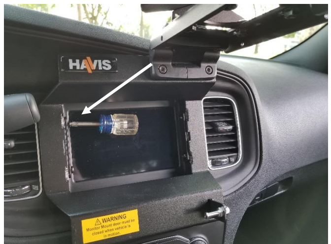
Attach main C-DMM-3005 frame to the side support brackets using 10-32 x 3/8" screws and star washers.