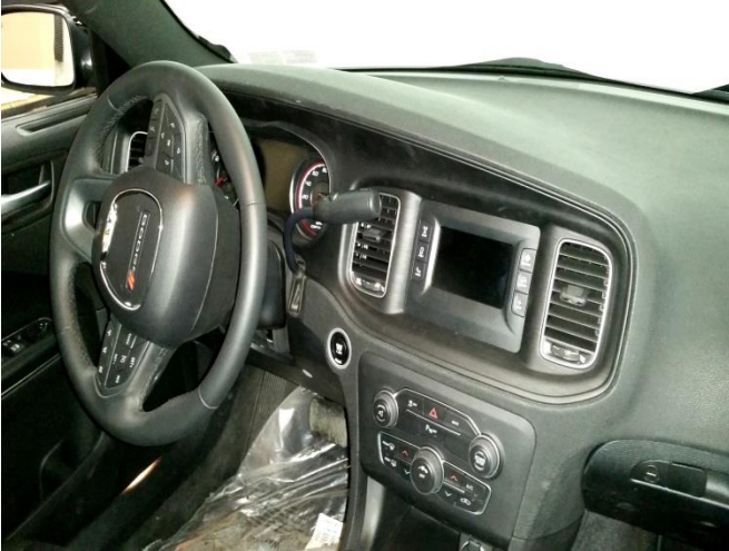
Dodge Charger Dash Prior to installation.