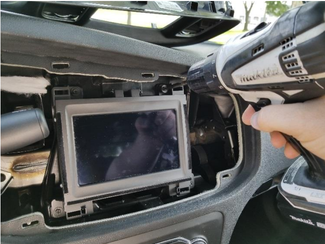
Reinstall the radio touch screen using the previously removed OEM hardware.