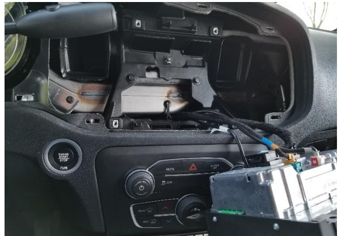
Temporarily remove radio touch screen.

NOTE: The touchscreen has a theft deterrent system built in so we suggest leaving the main power plugged in.