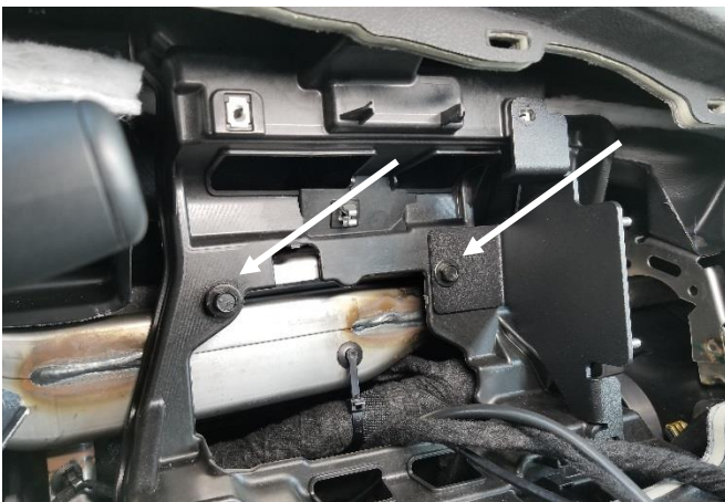
Temporarily remove two (2) OEM screws and attach support bracket with OEM screw as shown. 10mm socket.