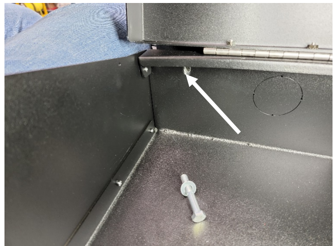
Slide 5/16" x 2" bolts partially through slots in top of SBX.