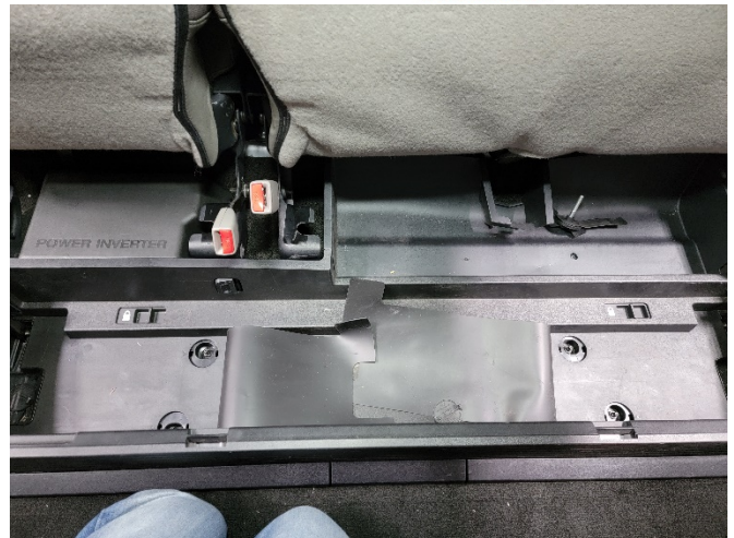
If equipped with OEM under seat storage bins, lift up mat to expose fasteners.