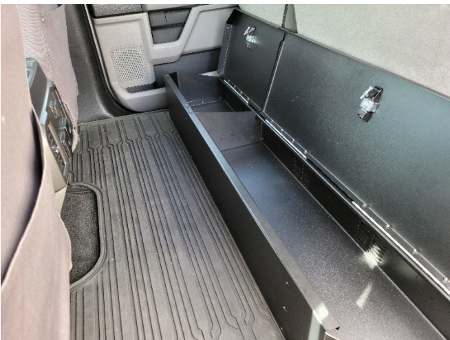
Place C-SBX-104 under seat storage box into vehicle. Center in vehicle and place up against OEM seat base.