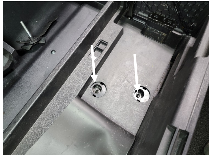
Remove (4) OEM nuts. These will not be reused.