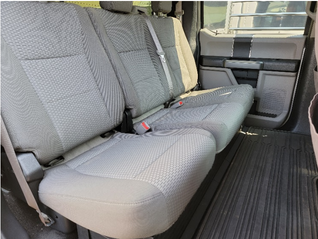
View of back seats of F-Series crew cab