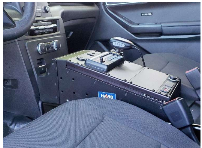
Wire and install equipment as needed. Installation is now complete.