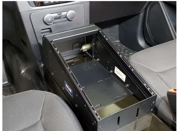
Place console on OEM tunnel plate. Slide tight to the dash.