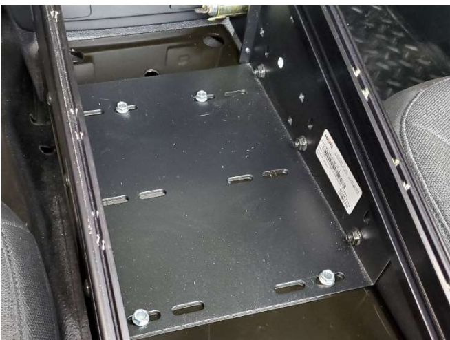
Reinstall console and attach using four (4) 1/4" x 3/4" self-threading bolts.