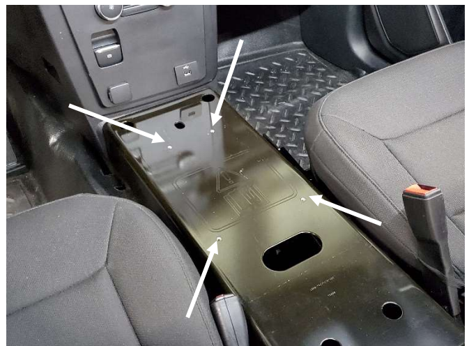
Drill out marked holes using a #7 or 13/64" drill bit.

NOTE: Do not mark or drill through the "No Drill Zone" that is indicated on the OEM tunnel plate.