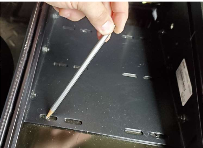
Mark the tunnel plate using a pencil or marker.

NOTE: Do not mark or drill through the "No Drill Zone" that is indicated on the OEM tunnel plate.