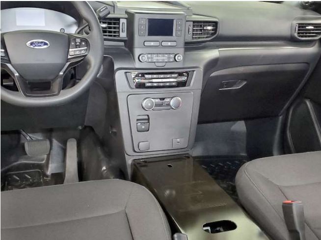
View of Interceptor Utility before install