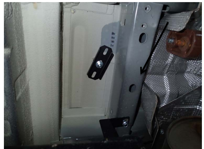
Installation is now complete.