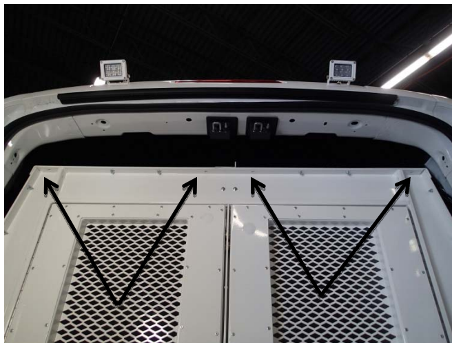
Remove four (4) carriage bolts from upper door frame assembly