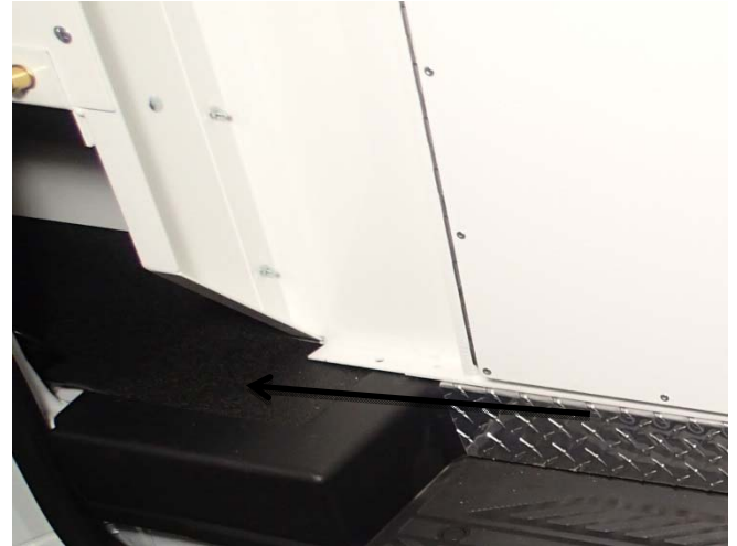
On the three compartment insert the side through bolt will not be used. This is due to obstructions under the van.