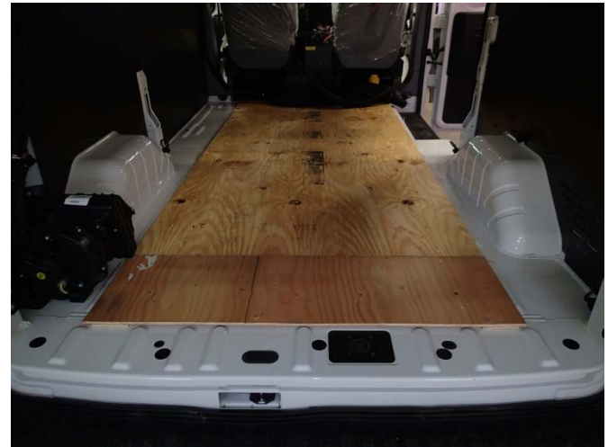
Cut and install 1/2" thick plywood subfloor Approximately (2) 1/2 x 48" x 96" sheets required. (Plywood and flat head screws not included with kit)