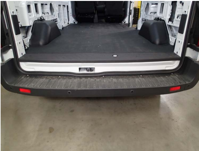
Remove factory rubber mat and rear floor trim.