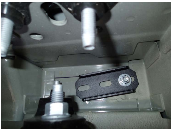
Be sure to use the fender washer when installing the lock washer and nut.