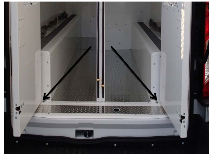
On the double and triple compartments you will use the holes on the outer portion of the door frame.