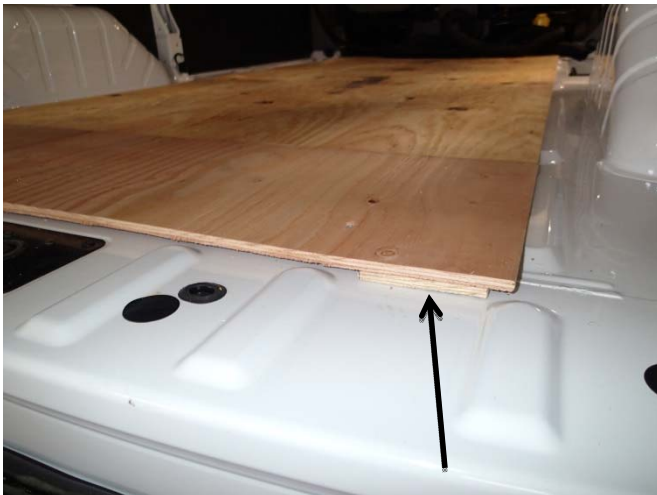
Overall length of plywood should be at least 102" long (for 100" insert) or 122" long (for 120" insert) to match insert length plus rear sill trim. Additional piece needed for side entry area. Cut 4x4" square spacers and install in corners as shown. These prevent the wood from bowing when the kit is bolted down later.