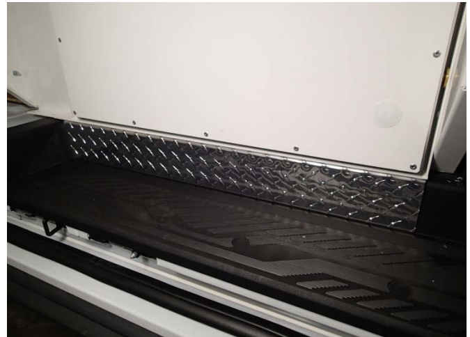
Make sure trim is even and continue with door frame installation using #10 x 1" Phillips pan head screws for door frame and trim.