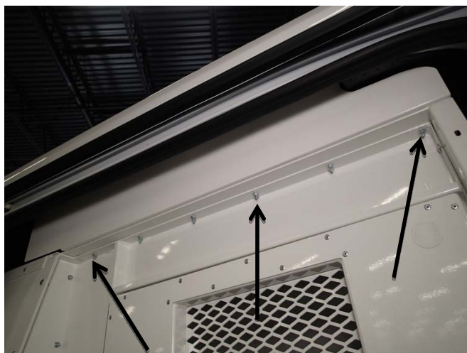
Remove three (3) carriage bolts from upper door frame and slide upper filler panel into place. Re-install carriage bolts and make sure the filler is even. Tighten all hardware.