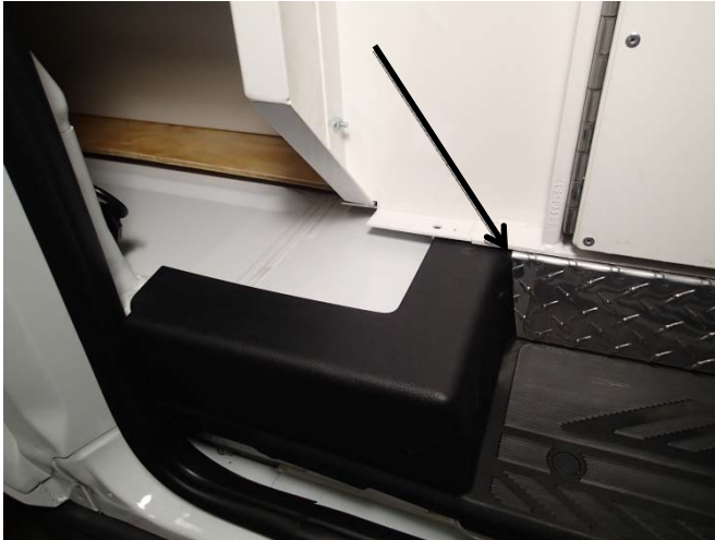
Angled side of the trim piece should contour the factory step trim