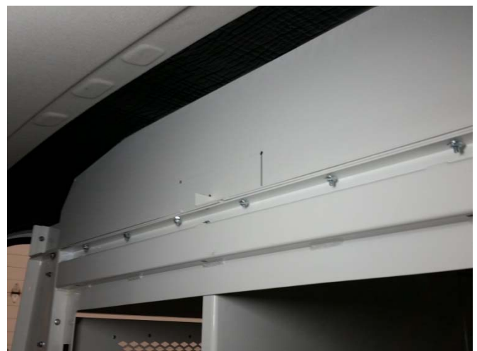
Repeat process for front trim