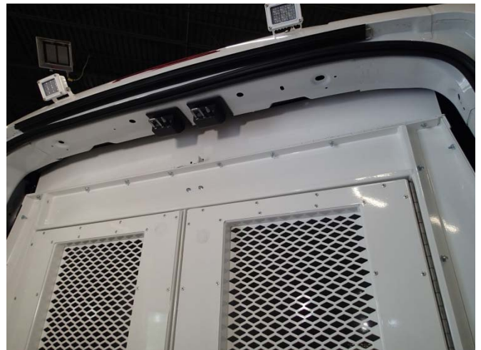
Slide trim into place and re-install previously removed carriage bolts. Make sure trim is even and tighten all hardware.