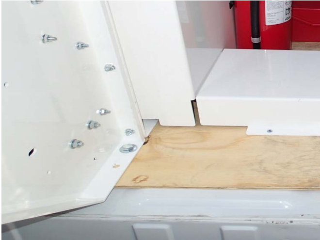
When bolting the front bulk head through the floor use the inner hole as shown.