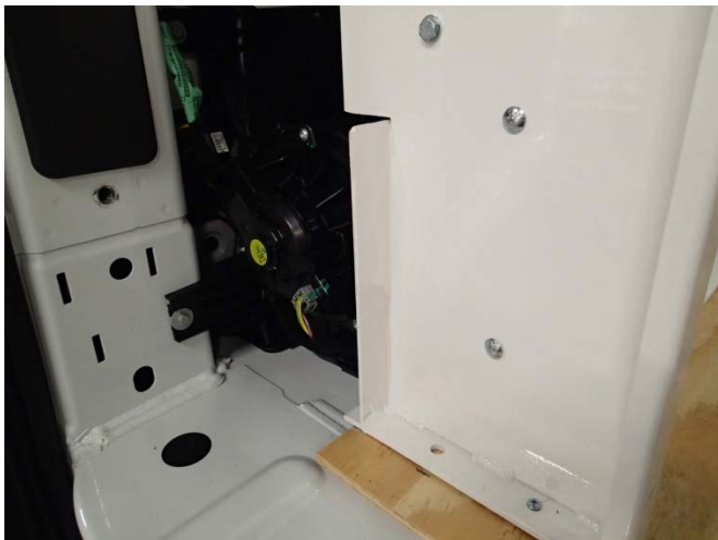
Use the outer mounting hole on the rear door frame on the single compartment. This will allow the bolt to drop between two frame supports.