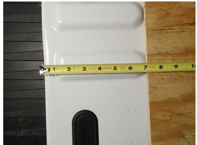
Space plywood 7" forward from rear center of van.