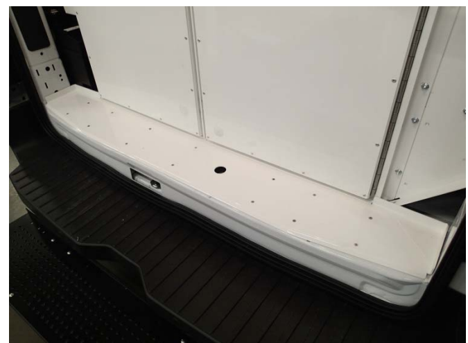
Line up rear door sill (KKM006910) to the rear bulkhead.

Rear bulkhead will be 1.5" inches forward from end of plywood.