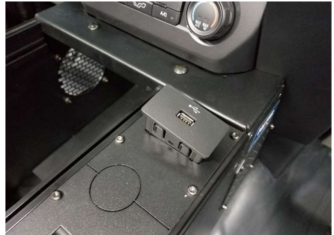
Install OEM AUX module into the console. Adaptor plate with #8 flat head screws provided for smaller Aux module. Blank plate provided if vehicle has no module for this location