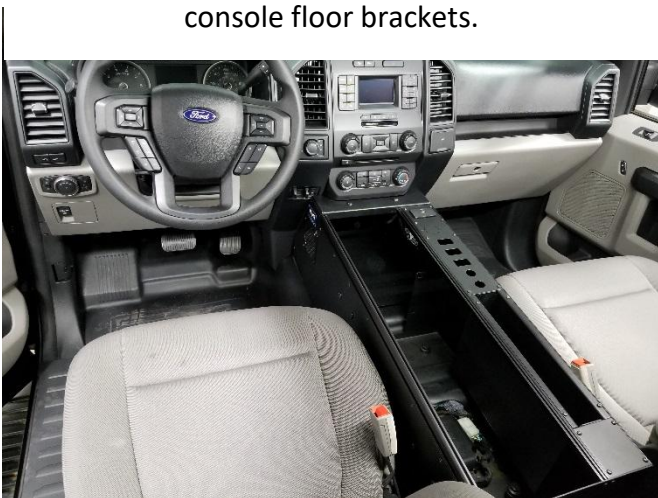
Main Housing installation is now complete. Install and wire equipment as desired.