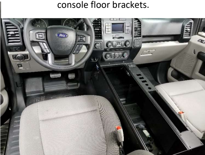
Main Housing installation is now complete. Install and wire equipment as desired.