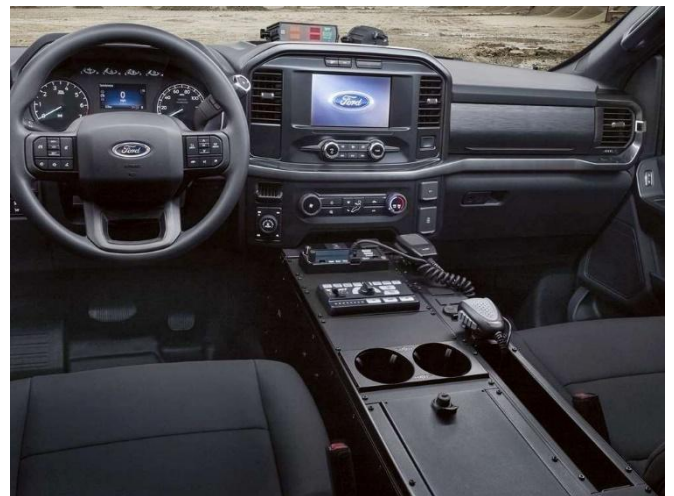
Console with computer installation complete.