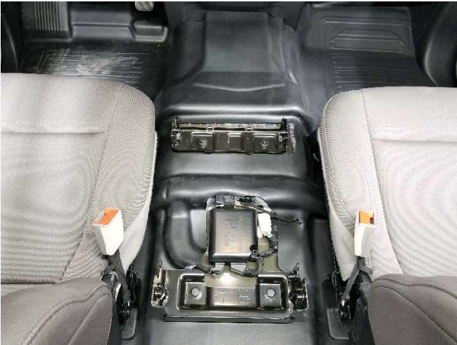
Remove factory center seat or mini console