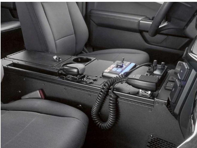
Console installation complete. C-VSW-3000-F150-3 shown.