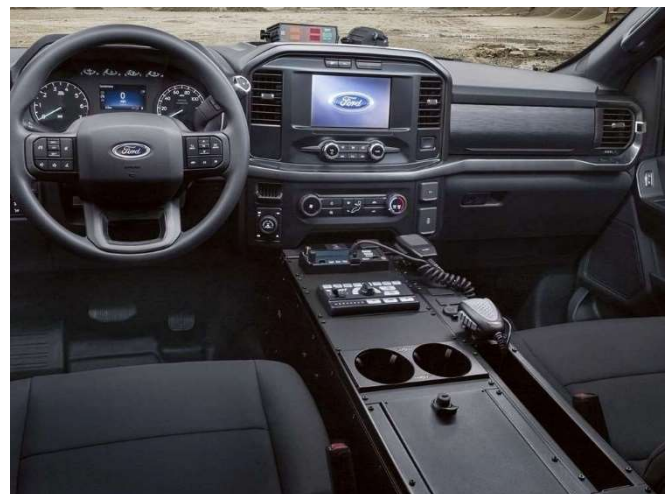
Console with computer installation complete.