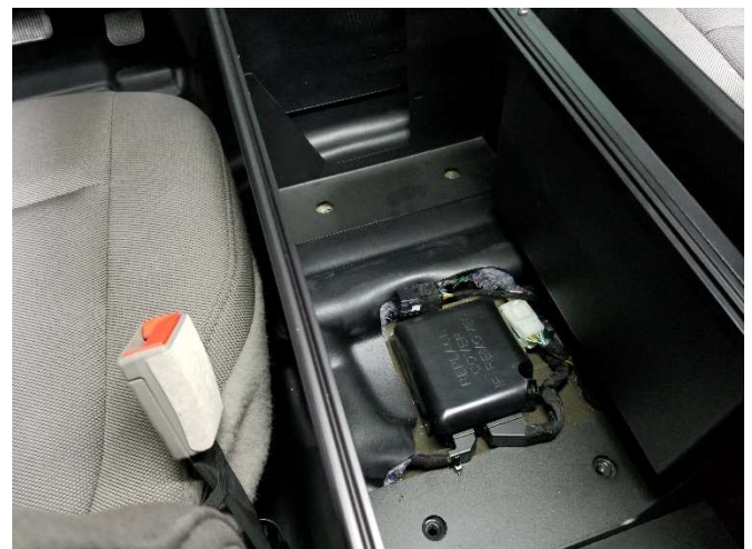
Slide console forward until the mounting brackets line up with the OEM mounting points in floor.