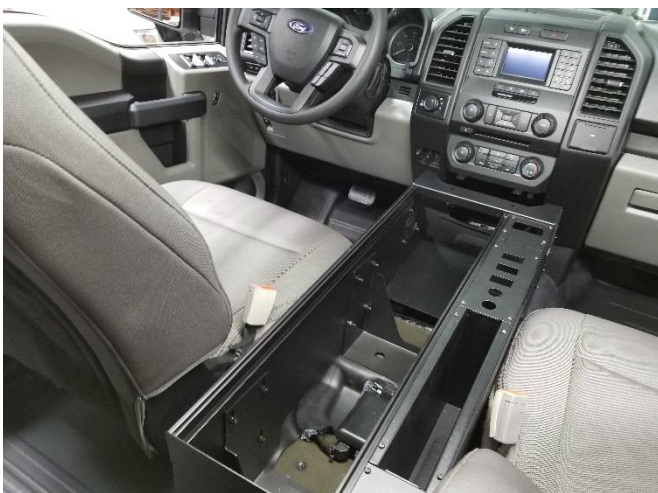
Place console with floor mount brackets into the vehicle. Shown with optional 3.3 wide panels and pocket.