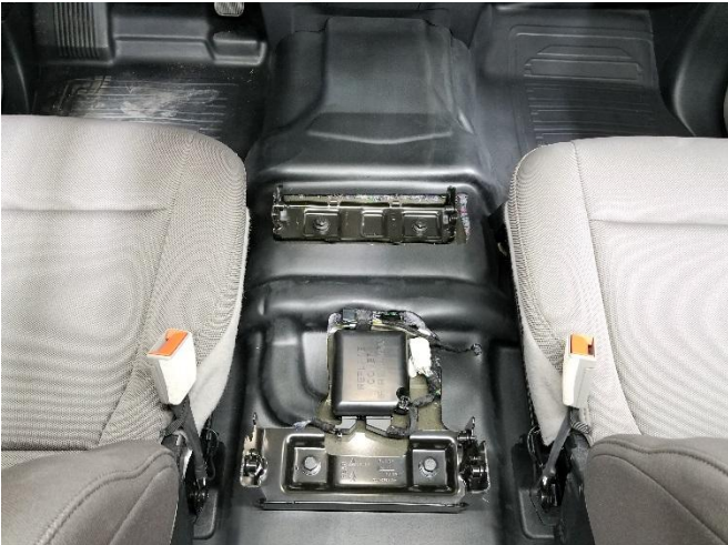
Remove factory center seat or mini console