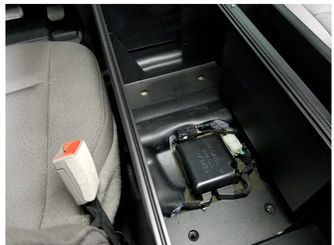
Slide console forward until the mounting brackets line up with the OEM mounting points in floor.