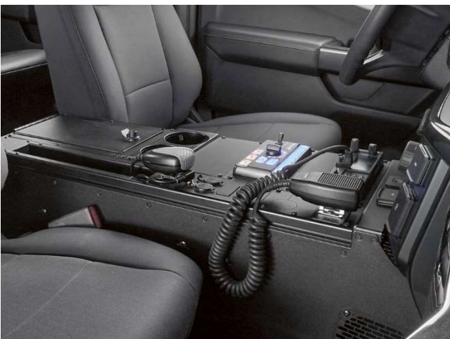
Console installation complete. C-VSW-3000-F150-3 shown.