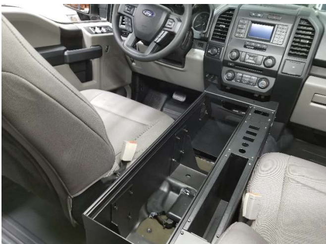
Place console with floor mount brackets into the vehicle. Shown with optional 3.3 wide panels and pocket.