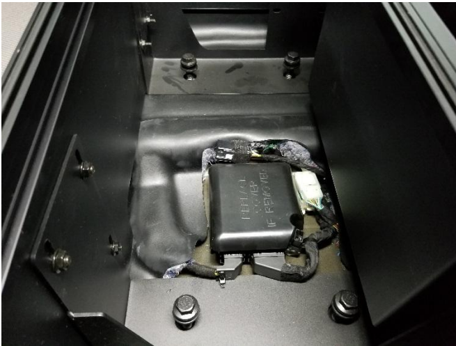
Loosely reinstall factory floor bolts through console floor brackets.