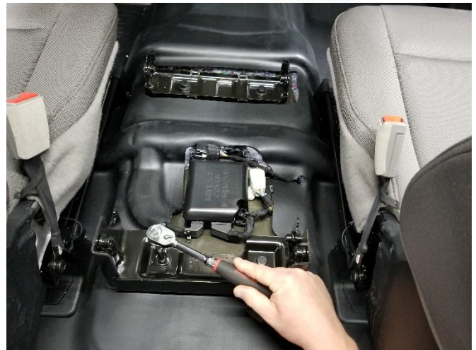
Unbolt factory bolts and save for later. 18mm socket