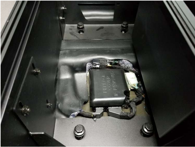
Loosely reinstall factory floor bolts through console floor brackets.