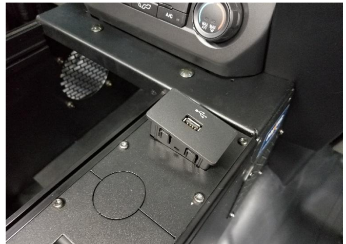
Install OEM AUX module into the console. Adaptor plate with #8 flat head screws provided for smaller Aux module. Blank plate provided if vehicle has no module for this location