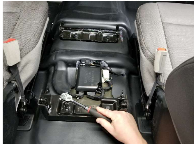
Unbolt factory bolts and save for later. 18mm socket