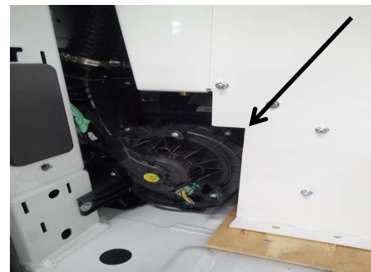
NOTE: If retrofitting a Prisoner Transport out of an older van the following modification will need to be made to the rear bulkhead to clear the factory or aftermarket blower motor assembly. Approximately 8" x 1.25" must be cut out of the left side of the bulkhead.