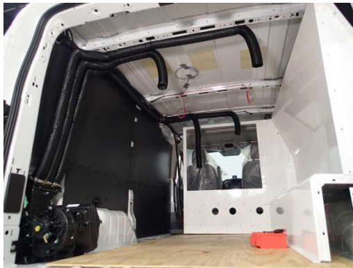
Run a single long length of hose and attach the "Y" and split the hose into two vents in driver and passenger side front ceiling. This will provide a total of four ceiling vents.