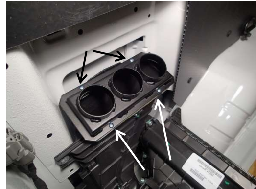
Install the vent adaptor (KKM006915) onto the blower motor of the OEM rear AC unit using four (4) #10 x 3/4" screws.