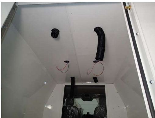
While installing the ceiling into the kit be sure to fish the hoses into the appropriate holes for install.