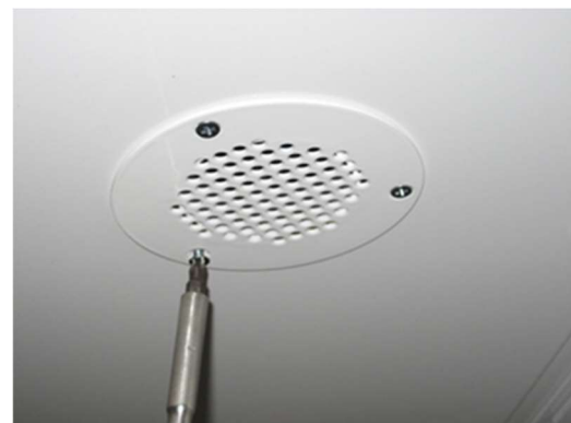
Align the three mount holes of the vent adapter cover with the pre-punched holes in ceiling. Attach each vent to ceiling using #8 x 3/8" flat head sheet metal screws. (Screws included with standard insert hardware)