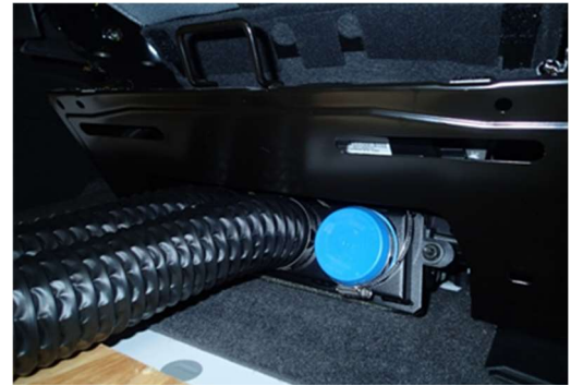
If you're not installing a 3 compartment kit then you will need to install a vent cap (PRM97503) on one of the outlets in the plenum. NOTE: Some caps may be smaller in diameter. These smaller caps can be press fit into vent from back side.