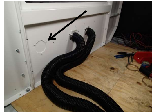
On the one and two compartment kits you will need to use the vent block off (KKM0403-004) on the opening closest to the passenger side of the kit