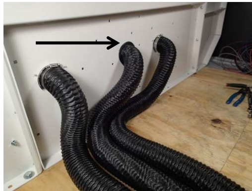
If installing a 3 compartment kit you will need to run a hose through the middle hole in the bulkhead. This will allow the hose to run underneath the bench and attach to the middle bulkhead. Run gimp around the hole in the front bulkhead before running the hose through.