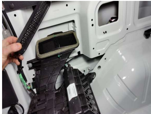
Remove the upper vent cover completely. It will not be re-used.