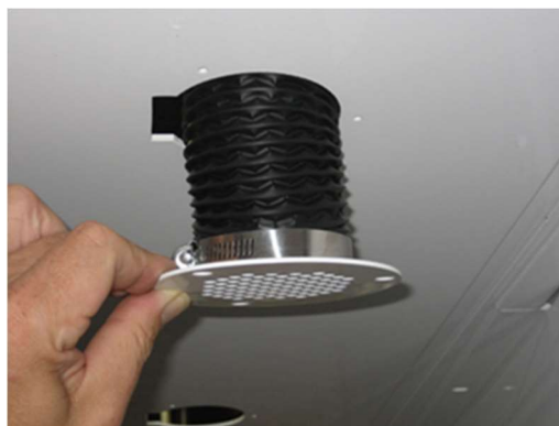
Route hose into ceiling holes and cut off any extra slack.. Attach the hose to the vent bracket (25567) using a 3" hose clamp.