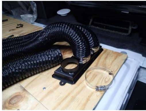
Attaching the heater hose and clamps to the front plenum assembly (KKM006916) before installing is recommended.