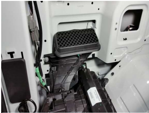
View of OEM rear Air Conditioning unit before install