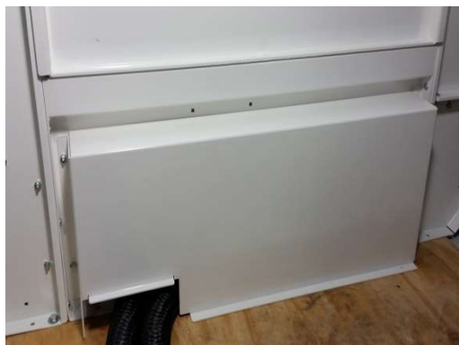
Optional PT-A-504 cover (see parts list below)