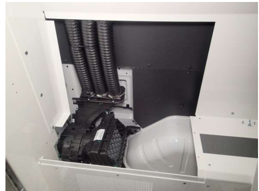
This shows the rear access panel removed and the factory AC system. This cover is easily removable for serviceability in the event of failure.