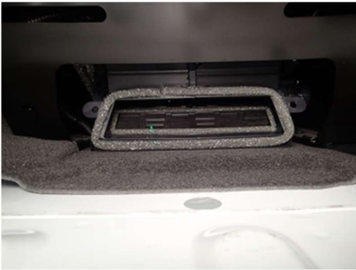
View of front OEM heat blower motor assembly. Located underneath passenger front seat.