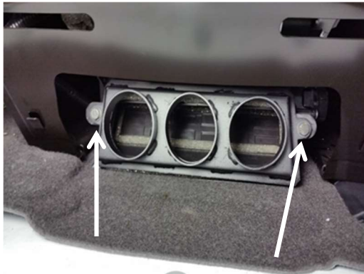
Install the plenum (KNM006916) to the blower motor using two (2) 1/4" x 3/4" bolts and 1/4" serrated nuts. (Plenum shown without hoses to show hardware)