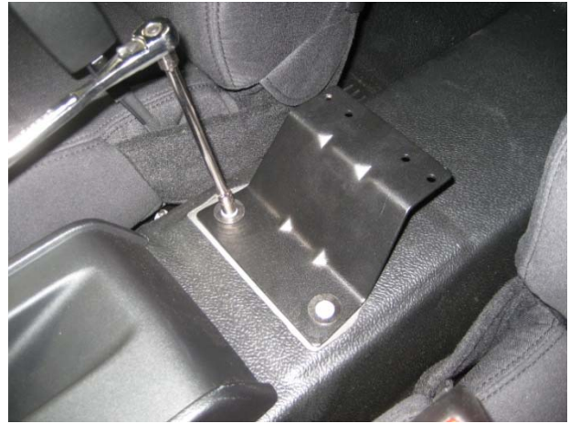
Mount CM001777 Rear Bracket to transmission hump with self-threading screw #GSM33060-1