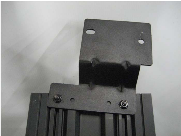
Loosely attach front bracket CM001776 to bottom of Trak extrusion with two (2) \frac{1}{4} " x \frac{3}{4} " hex head bolts and serrated nuts. Note: The head of the bolt slides into the Trak slot.