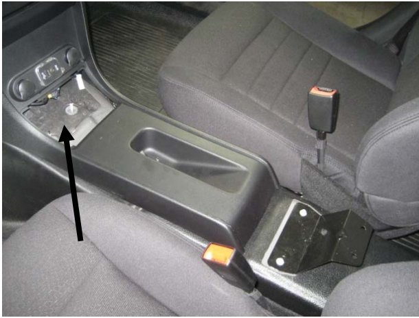
Remove OEM center forward cover panel.