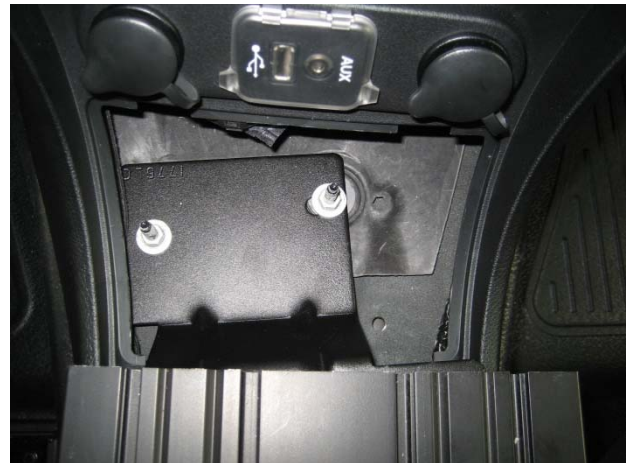
Loosely attach front bracket and Trak to OEM floor studs with 6mm nuts.