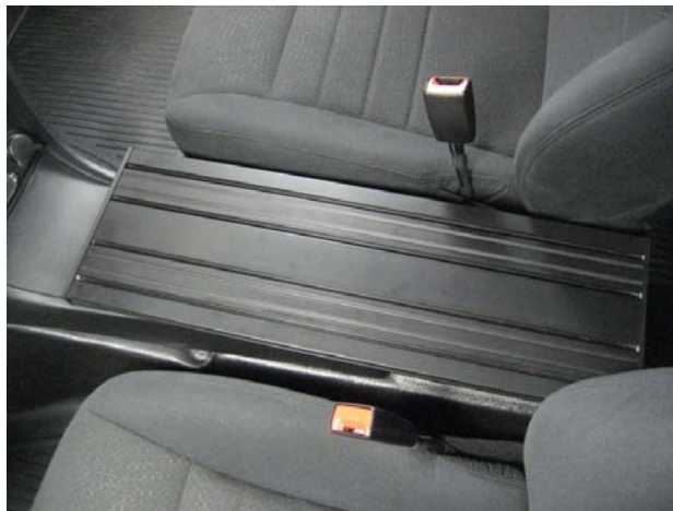
Attach Trak to rear bracket with \frac{1}{4} " x \frac{3}{4} " Hex head bolts and serrated nuts. Tighten hardware and replace OEM front trim. Slide necessary console mount hardware into the top of the Trak and attach self-adhesive end caps on ends of Trak.