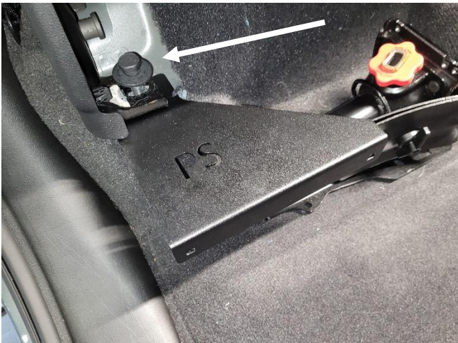
Loosely attach passenger side bracket to OEM passenger side rear seat floor bolt.