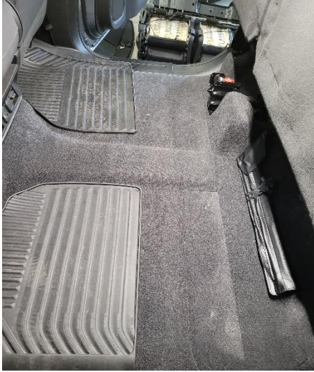
View of Silverado crew cab with back seats flipped up.