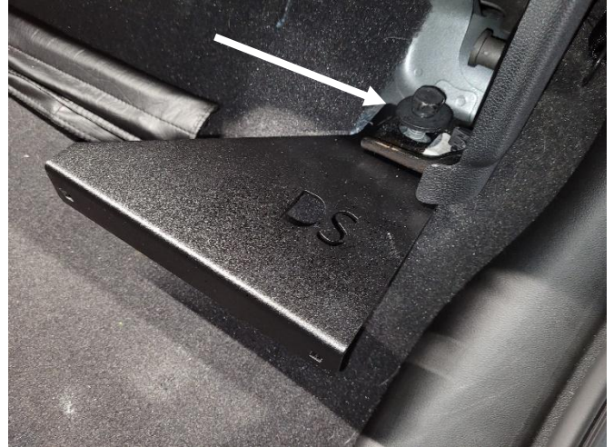
Loosely attach driver side bracket to OEM driver side rear seat floor bolt.