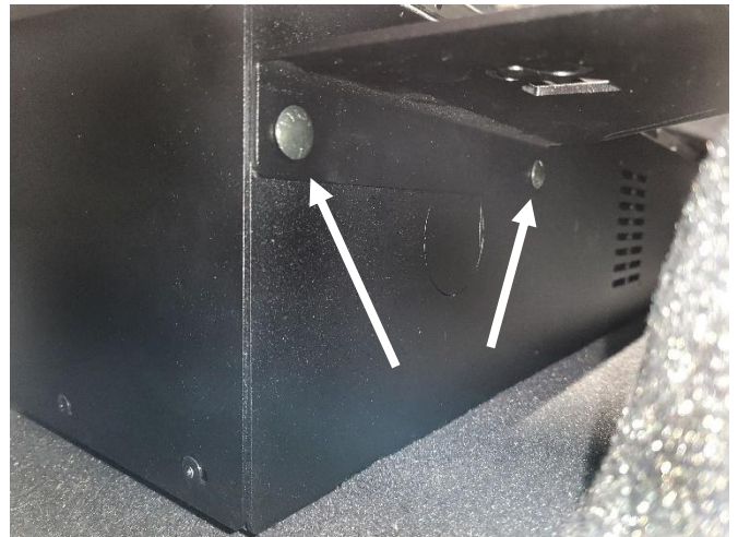
Loosely attach storage box to brackets with 1/4"x 3/4" Carriage bolts and serrated nuts.