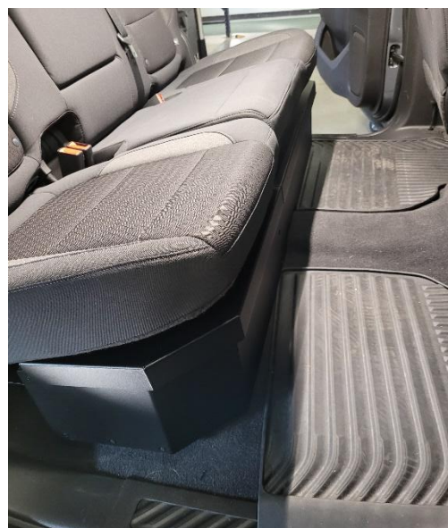
Installation is now complete.

Note: Tighten seat bolts to OEM torque specifications.