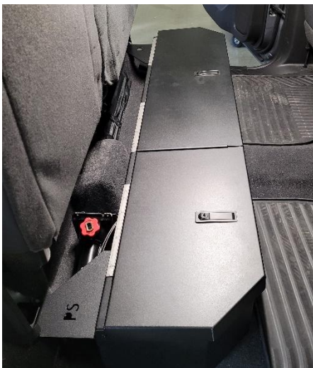
Tighten all hardware and double check lid and latch functions.

Note: Tighten seat bolts to OEM torque specifications.