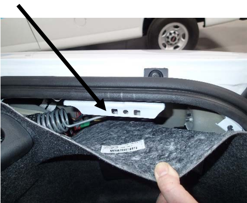
Photo shows 2019 without cargo hook and trunk liner pulled down. The existing OEM metal bracket has holes that must be avoided when mounting TSM upper bracket. Properly position TSM so upper bracket holes are outboard of OEM holes.