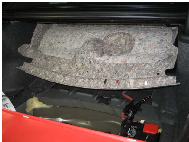
Remove upper trunk liner