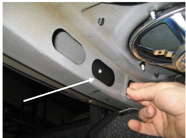
Upper Rear Bracket mounting.

Insert nut backing plate into existing holes as shown.