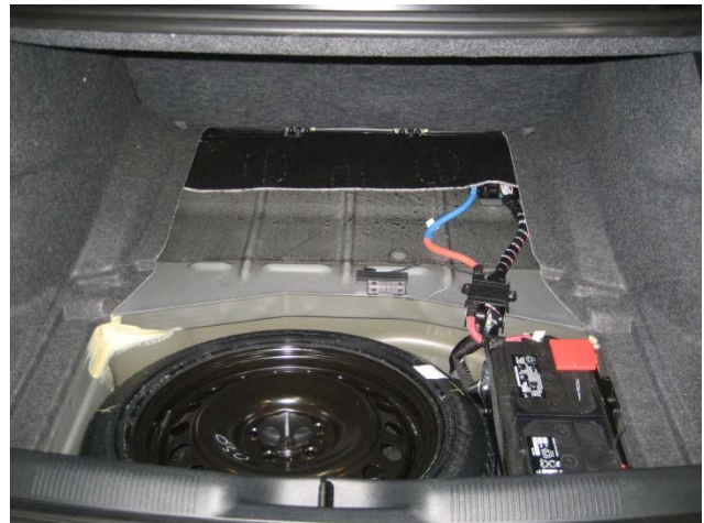
Remove floor cover