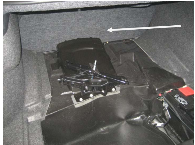
Remove spare tire and tire bracket.

Remove Rear Seat for better access to trunk.