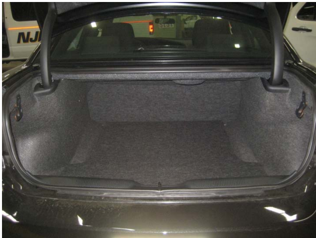
View of OEM space saver spare tire trunk.

Remove Rear Seat for better access to trunk.