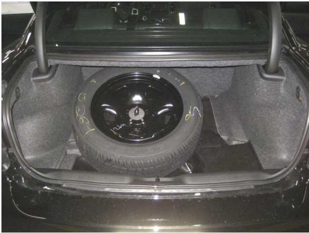
View of OEM Full size spare tire.