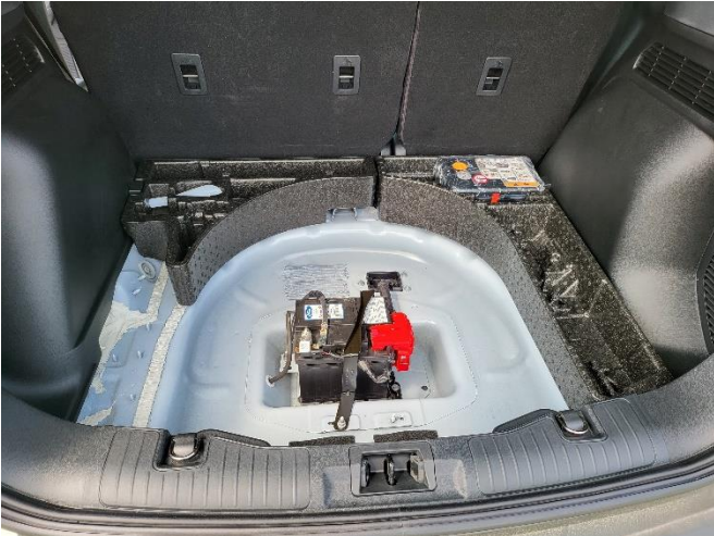
Remove rear cargo floor and foam cargo panels