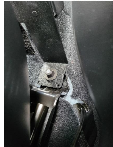
Remove OEM rear seat bolt and install two floor brackets. One each side.