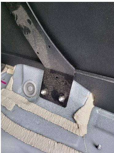
Use the M8x1.25 nuts and 3/8 washers to attach lower support to OEM studs at side floor.