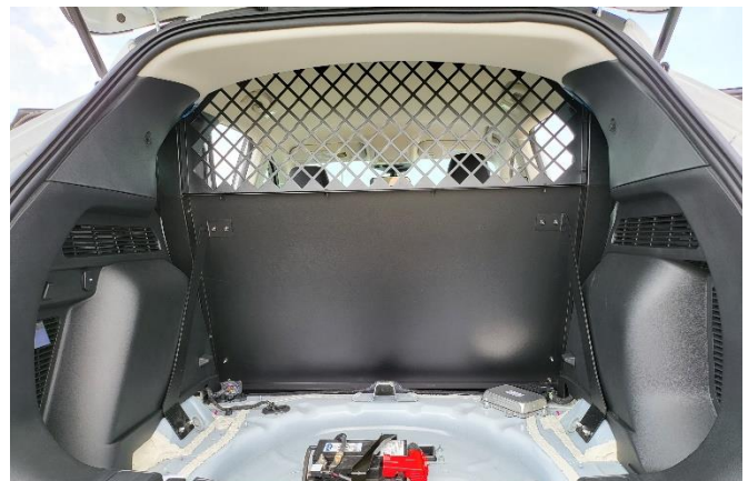
Attach side filler panels and upper section of cargo barrier with hex bolts and serrated nuts. Tighten all hardware, reinstall foam cargo panels and cargo floor. Installation complete.