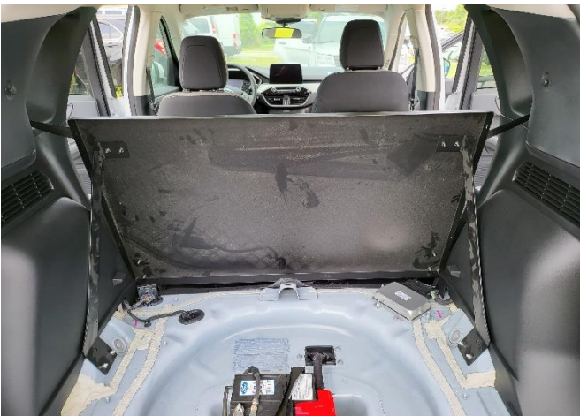
Fold rear seats forward and carefully place cargo barrier behind rear seats. Attach cargo barrier to floor brackets with serrated nuts.