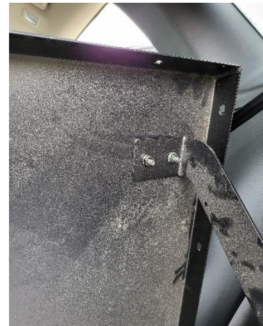
Loosely attach driver and passenger side vertical supports to barrier using 3/4" carriage bolts and serrated nuts.