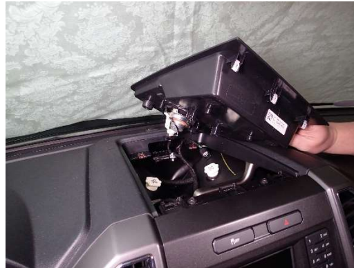
Pop up upper storage tray and unplug speaker.