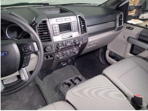
Model XLT dashboard before installation.

Note: Model XLT has optional CD player and model XL does not. CM008674 Filler plate is provided for XL application.