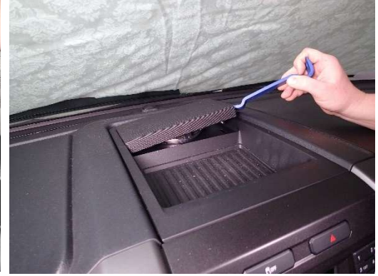
Gently pry up speaker cover If your vehicle does not have the speaker simply lift the rubber mat to expose the fasteners.