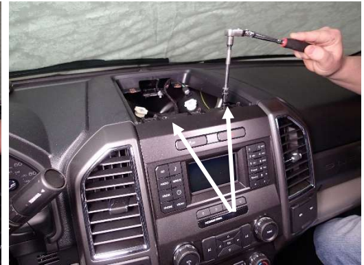
Remove two (2) 7mm head fasteners from top of radio and HVAC controller