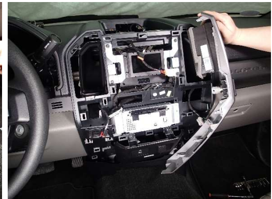
Gently pry along the side vent panels around the previously removed trim bezels starting at the top and working your way down.