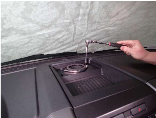
Remove two (2) 7mm head fasteners located next to the center channel speaker.