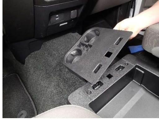
Flip up center seat and remove OEM cup holder.

Note: Model XLT has optional CD player and model XL does not. CM008674 Filler plate is provided for XL application.