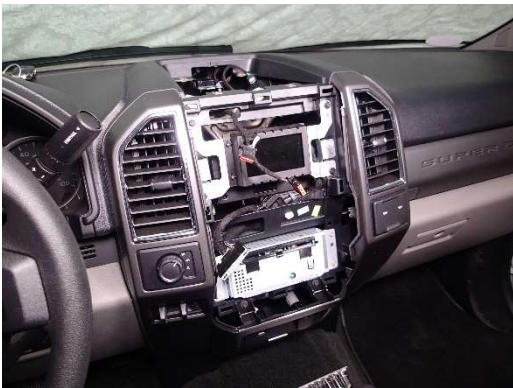
Starting at the top, gently pry along the radio and HVAC controller and remove.