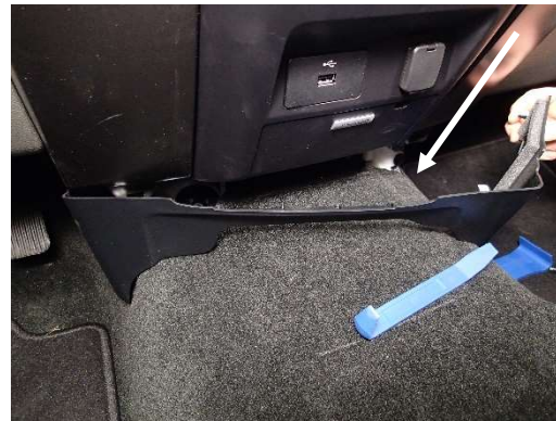
Unclip the lower trim panel from the lower portion of the dash. Pull to the side. It is not necessary to fully remove this panel.