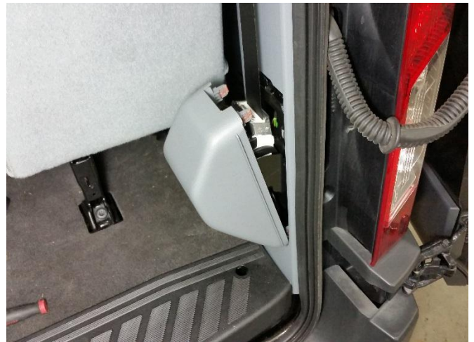
Pull cover from seat belt assembly