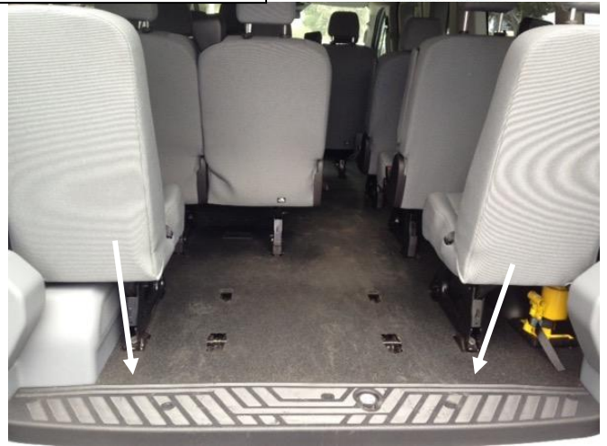
Remove cover over rear seat bolt.