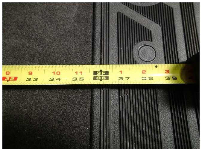
There will be approximately 36" of storage space behind the partition.