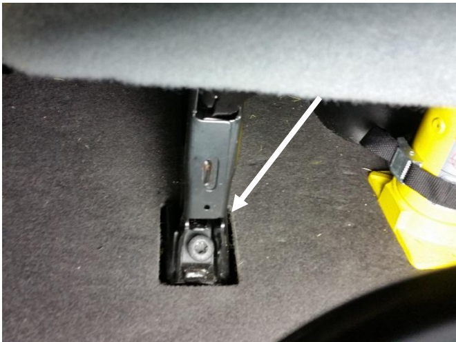
Remove T-55 seat bolt from floor