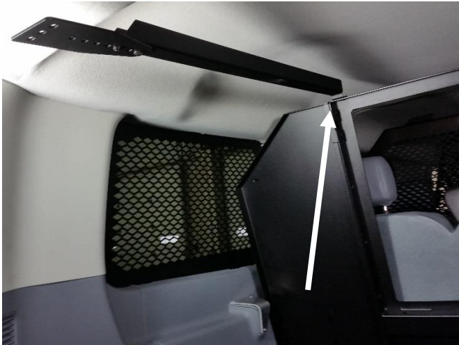
Attach upper mounting bracket to top of partition frame with 1/4" x 3/4" carriage bolts and nuts