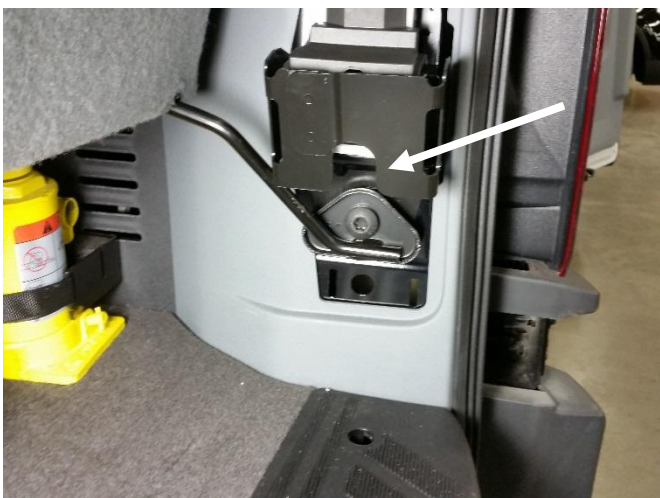
Remove T-55 bolt from lower seat support