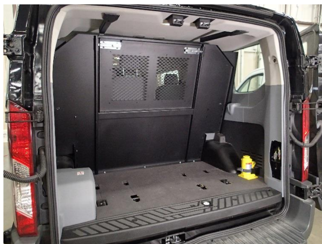
Completed P-REAR-3 with MFK-15 kit