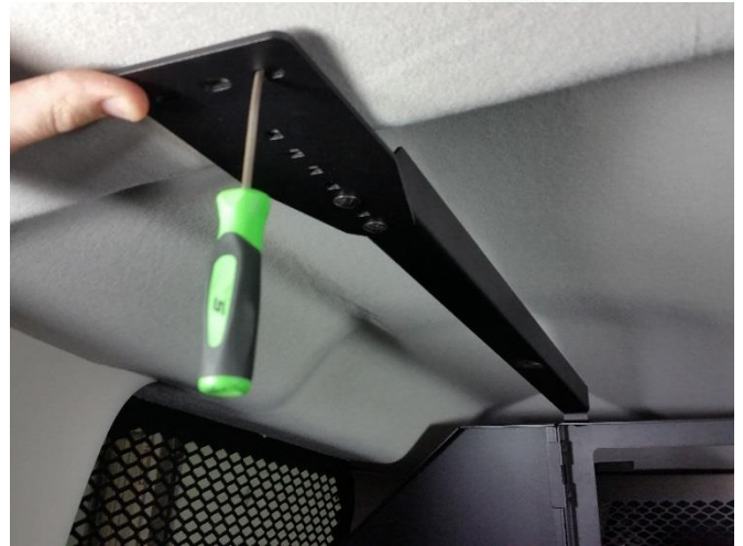
Verify sheet metal above headliner once bracket is lined up using a straight pick tool.