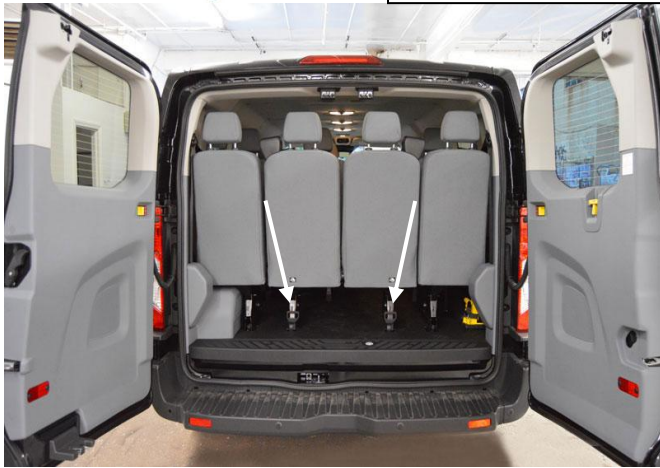
Remove center rear seats by pulling release handles and shifting seats forward. Unhook from the front and slide the seats out the back.