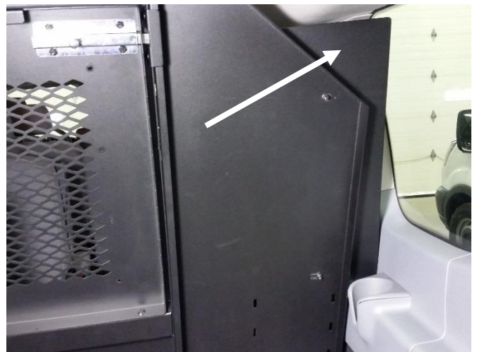
Attach upper and lower side filler panels with 1/4" x 3/4" carriage bolts and nuts. Tighten all hardware.