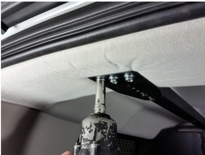
Attach upper mounting bracket to rear door header frame with 1/4" x 1" lag bolts.