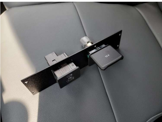
Snap USB and 12v socket into plate