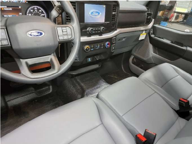
View of F-150 interior prior to install