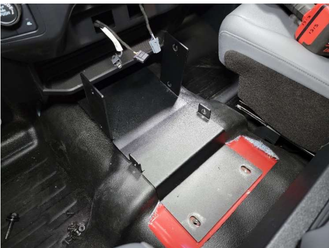
Place base mounting bracket in vehicle and line up to holes in floor.