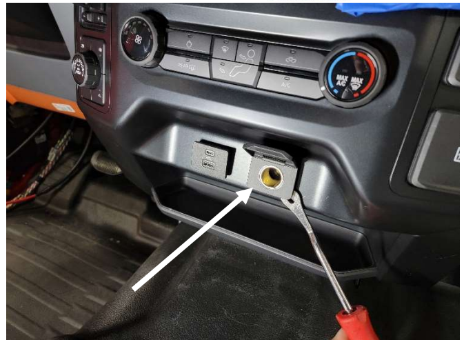
Remove OEM 12v socket and USB plate