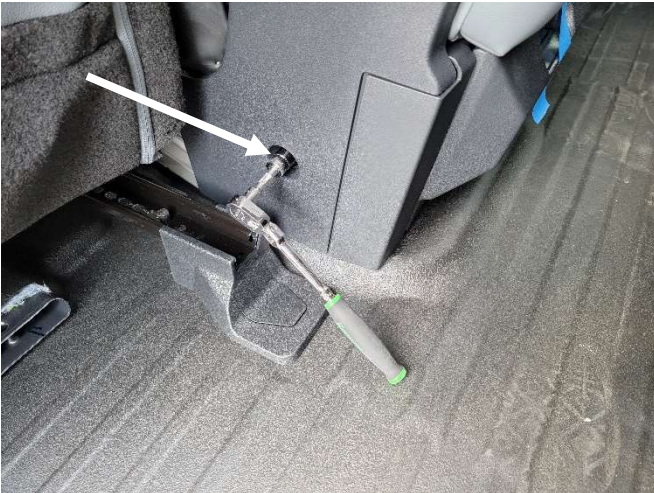
Remove bolts from rear, sides of middle seat.