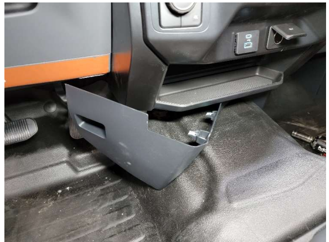
Remove lower trim