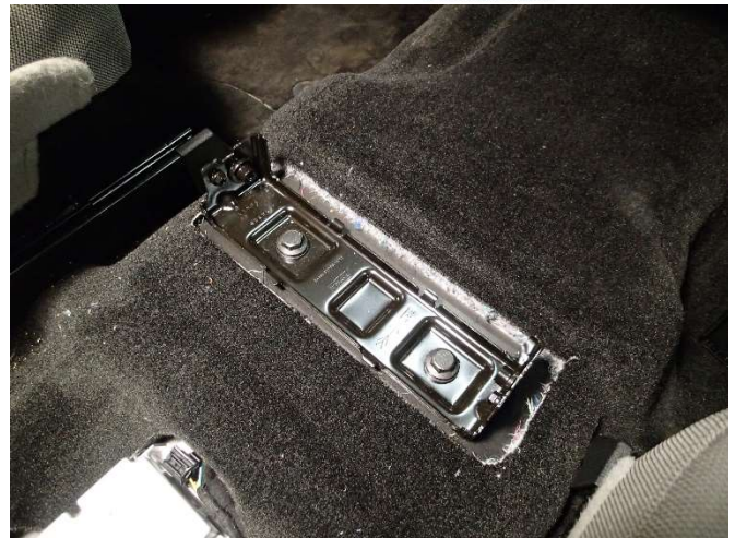
Unbolt forward, floor-mounting bracket