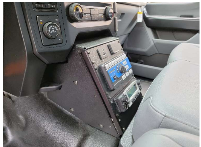
Installation is now complete.