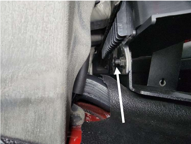
Install 1/4" serrated nuts onto the previously installed carriage bolts and tighten.