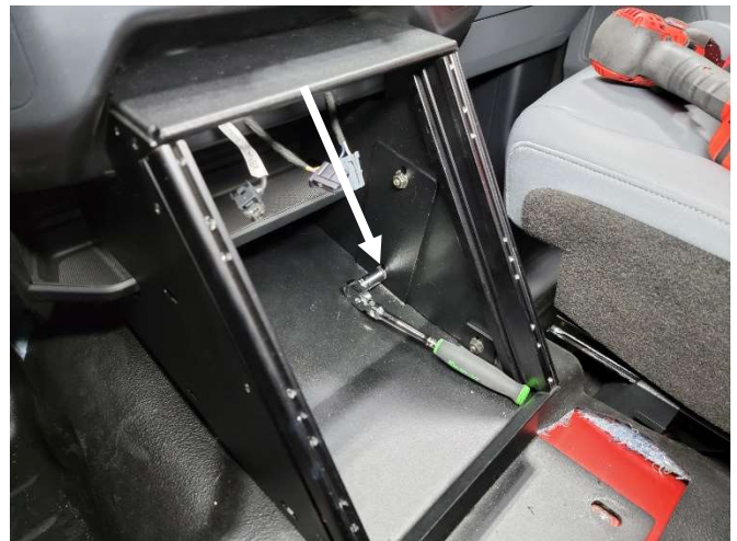
Slide console in over main mounting bracket and install using (6) 1/4" x 3/4" carriage bolts and serrated nuts.