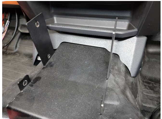
Place the lower dash trim into place, mark around mounting base and trim as needed to reinstall.