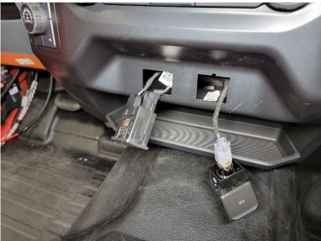
Unplug and remove from dash