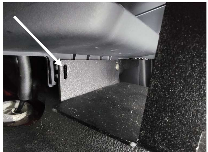
Install (2) 1/4" x 1/2" carriage bolts through the front of the bracket through the lower dash slots.