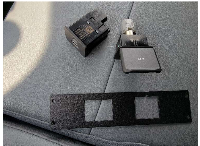
View of USB relocation plate