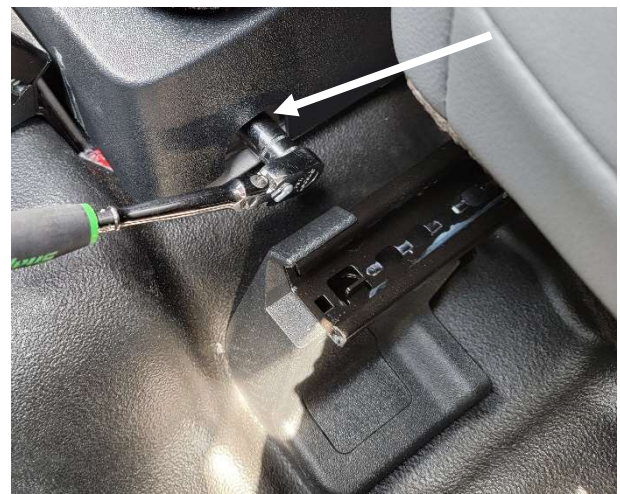
Remove bolts from front, sides of middle seat