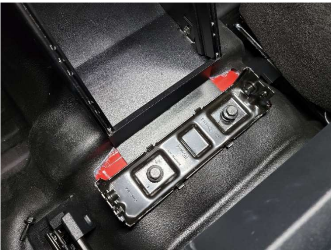
Reinstall previously removed OEM floor mounting bracket and torque to manufacturer's specifications.