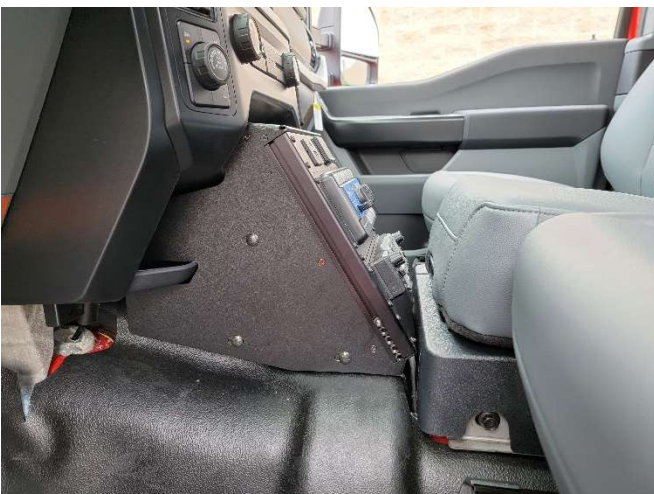
Wire, mount and install equipment prior to reinstalling OEM center seat.