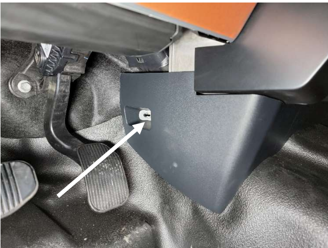
Locate 7mm head bolt from lower center of dash.