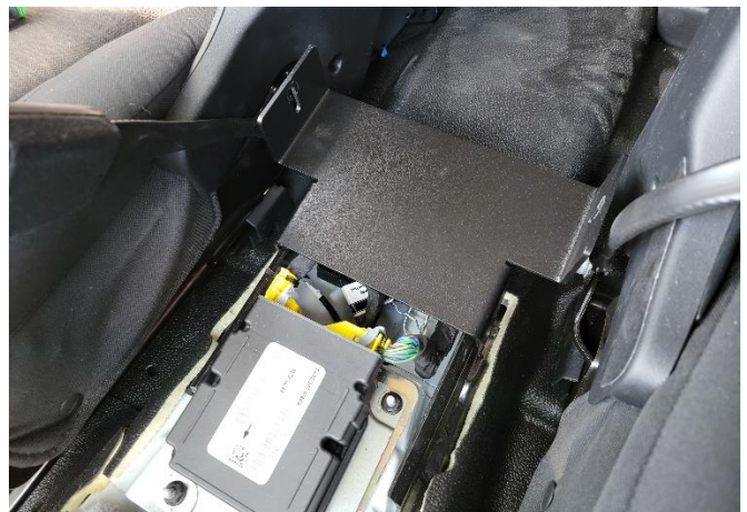
Place rear mounting bracket over rear mounting tabs.