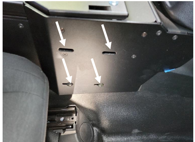
Attach passenger side of console to front mounting bracket with 1/4" x 3/4" carriage bolts and nuts.