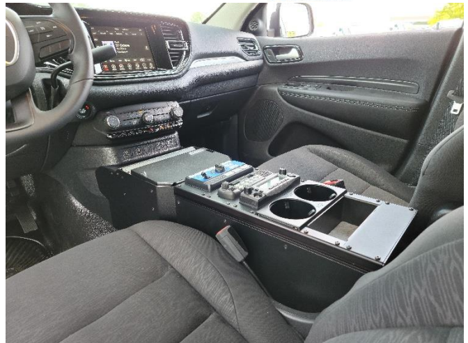
Wire and install all equipment.