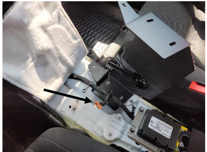
Remove the nut for the factory ground wire and unclip harness.