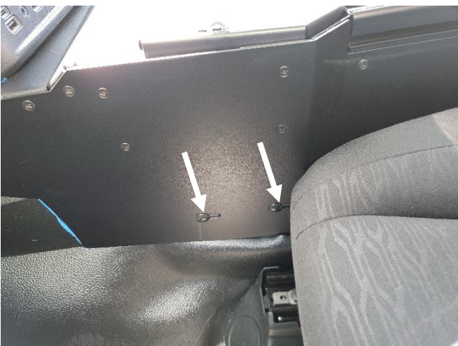
Attach driver side of console to front mounting bracket with 1/4" x 3/4" carriage bolts and nuts.