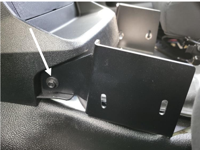
Line front of bracket up to center dash. Attach using previously removed 10mm head fasteners.