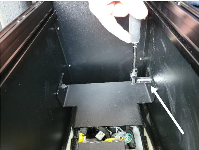
Attach rear of console to rear mounting bracket with 1/4" x 3/4" carriage bolts and serrated nuts.