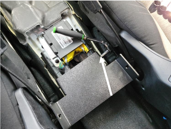
Attach rear mounting bracket using previously removed 10mm head fasteners.