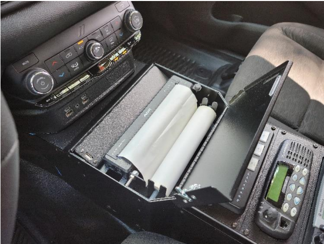
Install Brother PocketJet printer and paper roll into printer holder.